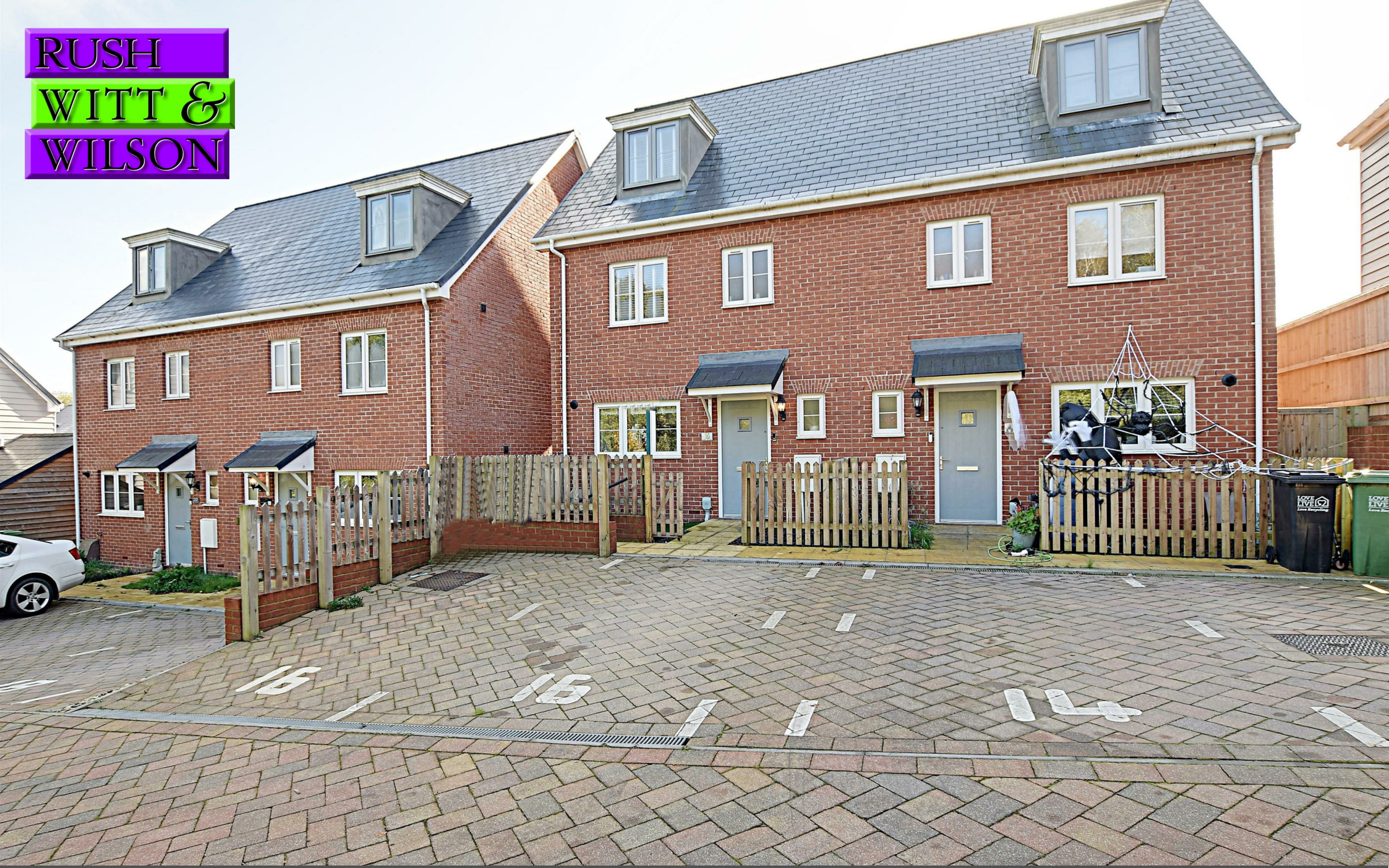
16 Preston Hall Close, Bexhill-On-Sea, East Sussex TN39 5FB £350,000